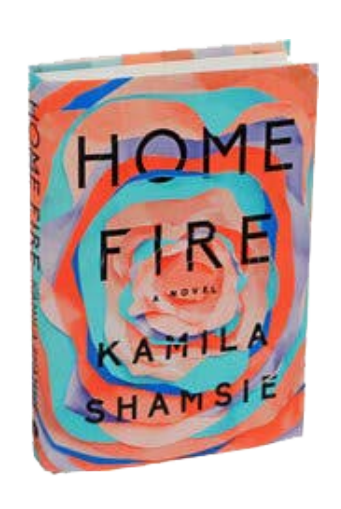
Author: Kamila Shamsie Originally published: August 15, 2017 Genre: Novel, Romance novel, Political fiction, Domestic Fiction